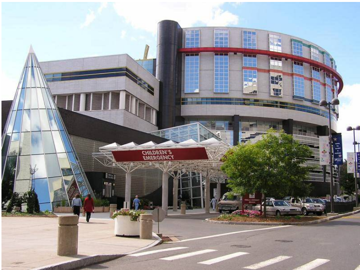
Connecticut Children's Medical Center